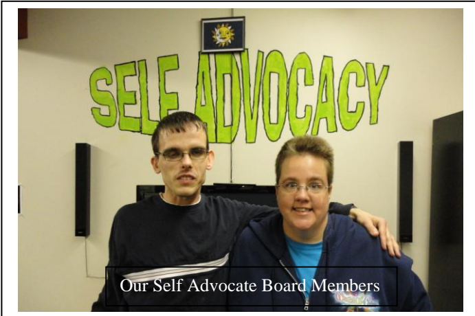
Our Self Advocate Board Members